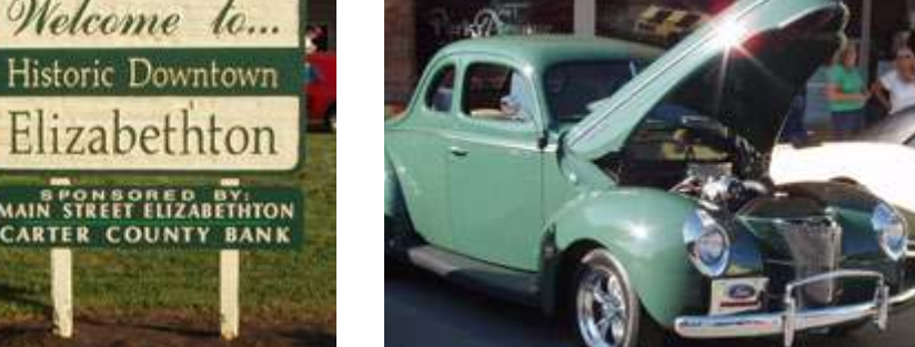
Offering attendees branded products for purchase is a great fundraiser for you and a great souvenir for them!