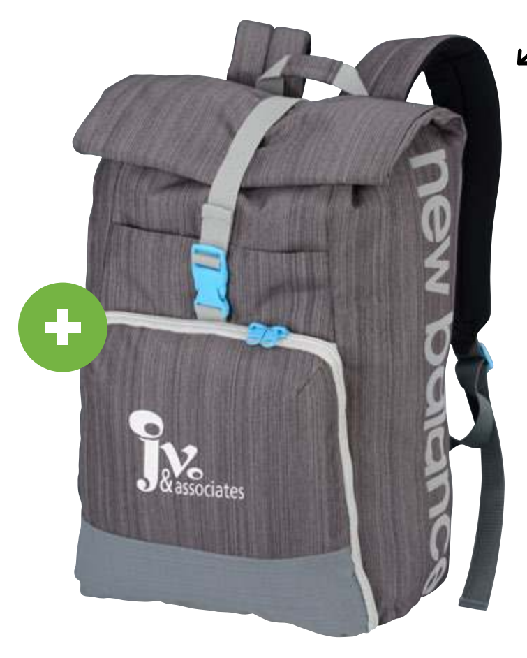
New Balance® Inspire

For teams who need a more polished image that reads more corporate than casual, the Wenger® Tech-Laptop Backpack sends all the right signals. Though this backpack features the convenience of a standard pack, with pockets for laptops, phones and other office gadgets, its streamlined style says it's all business.