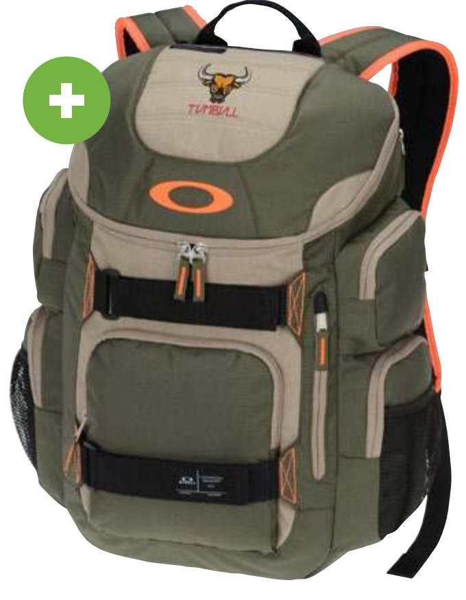
Oakley<sup>®</sup> Enduro 30L