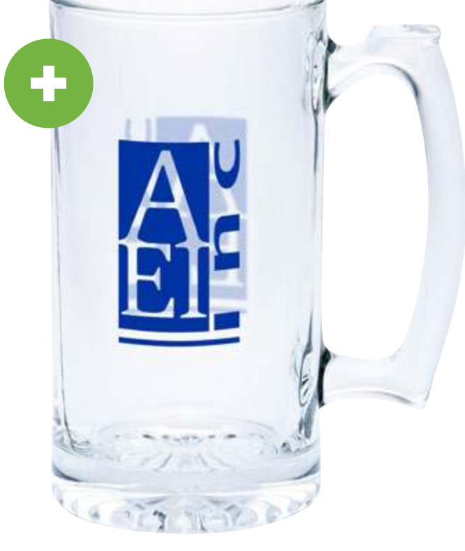
Beer Stein - 25 oz.

with an imprinted beer mug and an invitation to join us at a happy hour launch event. The mugs and launch party were a great way to celebrate all the hard work that went into the new brand!