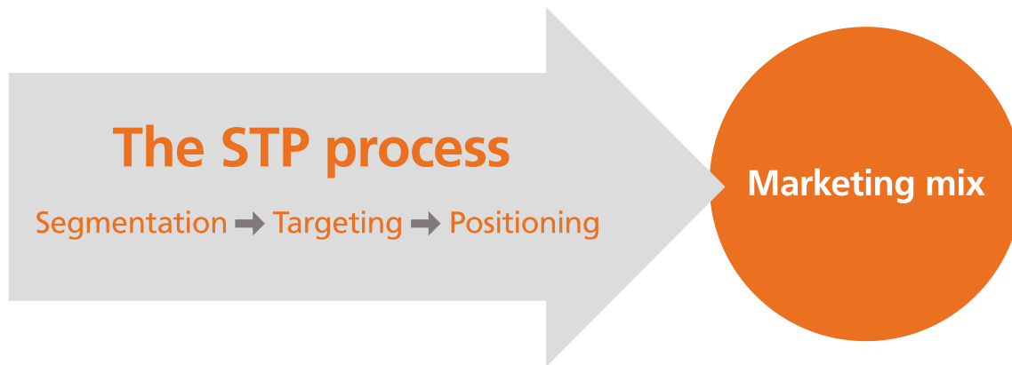
Figure 3. The STP process 12

segmentation, targeting, and positioning (see figure 3). Targeting is the selection of the target markets, and positioning is the process of defining a product in a way that sets it off from your competitor's product—essentially, it's how you convince consumers that your product is the one with the features and benefits they desire. The goal of this three-step process is to develop an appropriate marketing mix.